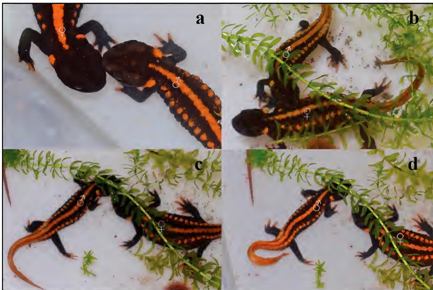
Fig. 4. Pre-spermatophore courtship behavior pattern of Tylototriton yangi in captivity. Clockwise from top-left: a ) male nudging the side of the female's head with his snout; b ) male nudging the side of the female's body; c ) male blocking female's path and beginning to fold his tail; and d ) male fanning the tip of his tail toward the female's head.

forelimb buds were present with very indistinctive toes; individuals had large abdominal yolk sacs; three pairs of gills were present, all of which were well-developed and were the same length as the head; tail fins were relatively deep (dorsal fin began from anterior part of the body, which runs for about three-fourths of the total length; ventral fin began from the posterior edge of the yolk sac, which runs about one-third of the total length). The dorsal surface of the body was yellowish brown and speckled with small dark dots, which formed two lateral bands running along the dorsal midline as well as the mid-lateral line. Speckled patterns also occurred on the tail fins. The gills were light pink and somewhat translucent, and the yolk sac was bright yellow with very few speckled patterns on the upper edges (Fig. 5b).